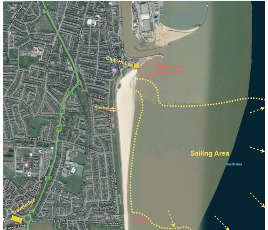
Travelodge -to- Clubhouse = 1.3miles (straight) = 2.3miles (drive)